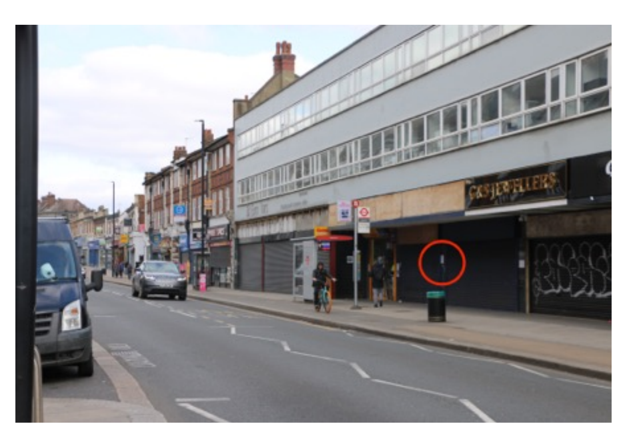
Merkus Slots will be positioned by the most central bus stop used by children and young people on the way to school

Given the risks to young people from gambling we very much welcomed the inclusion of gambling related harm in the NHS Long-Term Plan and the announcement on 24 June 2019 that the NHS is to open its first gambling clinic for children and young people. The new clinic for young people will open this year in London as part of an expansion of NHS services across England. Fourteen other clinics for adult gambling addicts are set to open.'